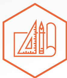
Planning & Consultation